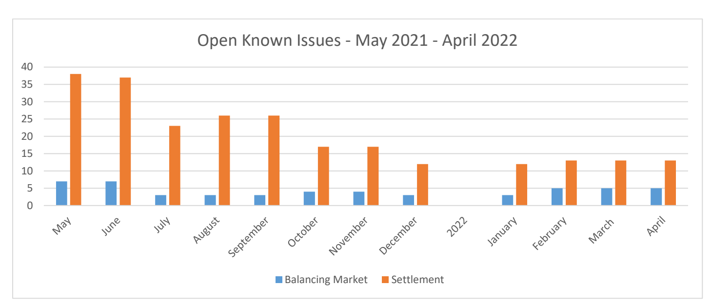
Figure 2 - Open Known Issues as of April 2022.

Table 5 below includes the Known Issues that have not yet been committed to in a specific market release at the time of publication. Known Issues that have been resolved or have been planned for resolution in a specific release at the time of publication are included for information above in Section 2.2.1.2. Further description of all of these Known Issues can be found in the Known Issues Reports under General Publications on the SEMO website at the following filtered link.