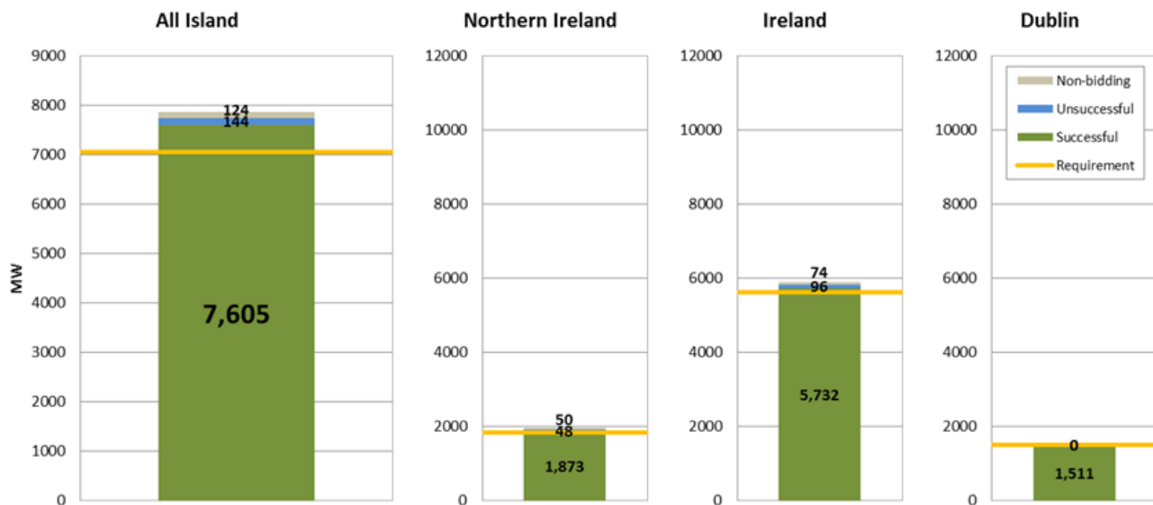
Figure 2: MW requirements and quantities successful, unsuccessful and non-bidding in the auction. The All Island values are the sum of the Northern Ireland and Ireland values. The Ireland values include Greater Dublin.

Figure 2 illustrates the quantity of de-rated capacity successful in the auction. It gives the all-island total and the breakdown for each locational capacity constraint area. It also shows the quantity that was unsuccessful and the quantity of qualified capacity that did not offer into the auction. The yellow horizontal lines indicate the minimum requirements in each area. All minimum MW requirements set in the auction were satisfied. Note that the requirements for this auction have been adjusted by the Regulatory Authorities.