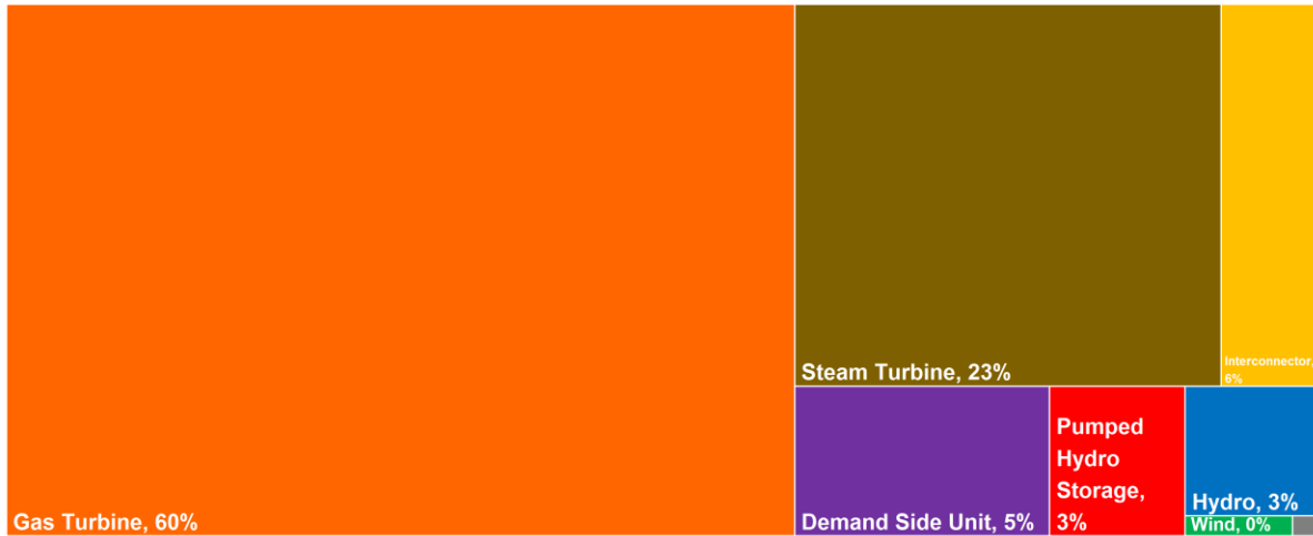
Figure 3: Illustrates the percentage of total de-rated capacity that each technology class was successful in the T-1 2020/2021 Capacity Auction. This just reflects the auction outcome in terms of de-rated MWs and does not indicate the final energy or installed capacity mix.

Figure 3 reflects the auction outcome in terms of de-rated MWs and does not indicate the final energy or installed capacity mix. It is important to note that the MW requirements set in the auction have been adjusted to take account of non-market generation and renewable generation that has not participated in the auction. To date, most renewable generation has not participated in the Capacity Auctions. Mechanisms like REFIT in Ireland and ROCs in Northern Ireland were specifically designed to encourage investment in renewable energy.