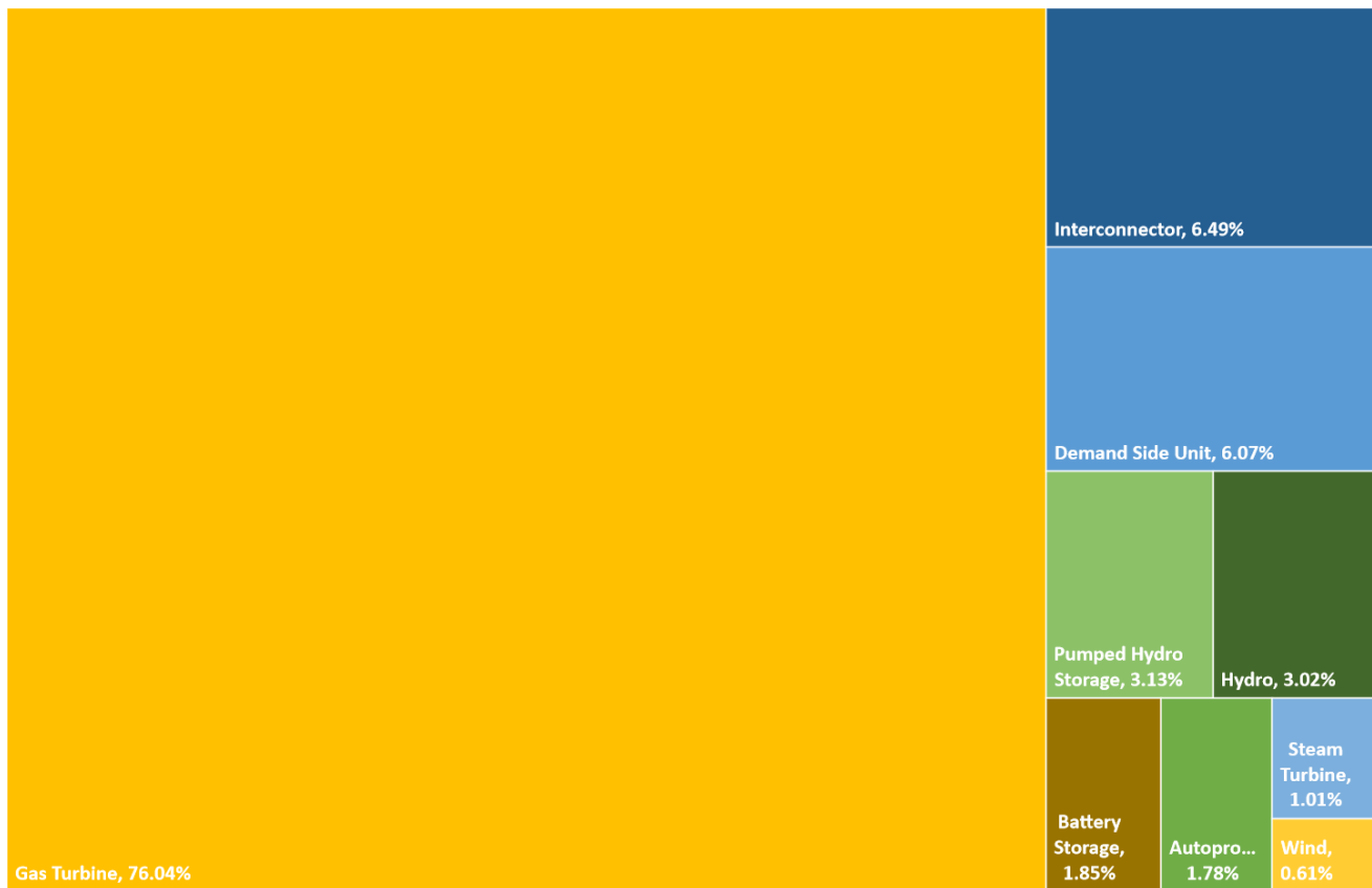
Figure 3 - percentage of total de-rated capacity that each technology class was successful in the T-4 2025/2026 Capacity Auction. This just reflects the auction outcome in terms of de-rated MWs and does not indicate the final energy or installed capacity mix.

Figure 3 reflects the auction outcome in terms of de-rated MWs and does not indicate the final energy or installed capacity mix. It is important to note that the auction required quantities have been adjusted to take account of non-market generation and renewable generation that has not participated in the auction. To date, most renewable generation has not participated in the Capacity Auctions. Mechanisms like REFIT and more recently RESS in Ireland and ROCs in Northern Ireland have been specifically designed to encourage investment in renewable energy.